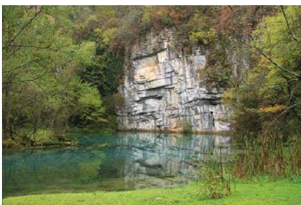
Plut D. et al., 2014. Regionalni viri Slovenije: Vodni viri Bele krajine (Water resources of Bela krajina), 15.

12.15–14.00: travel to Marindol, including an hour's walk to litter forests; long-term impacts of litter extraction, lasting for centuries, on soil characteristics, and, consequently, on species composition – and the question of recent vegetation changes in such light forests due to abandonment of litter-harvesting (Dr Žiga Zwitter)