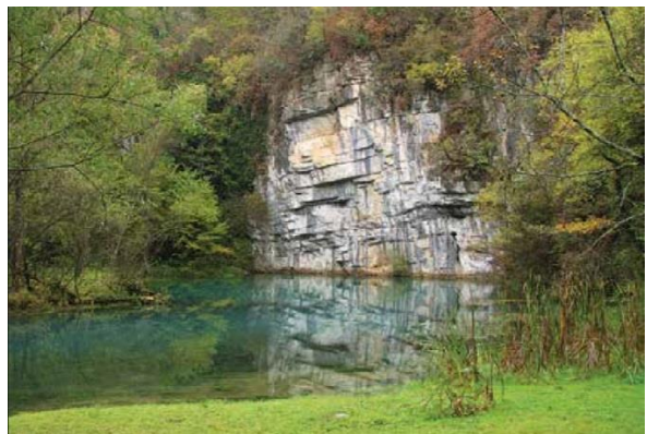
Plut D. et al., 2014. Regionalni viri Slovenije: Vodni viri Bele krajine (Water resources of Bela krajina), 15.